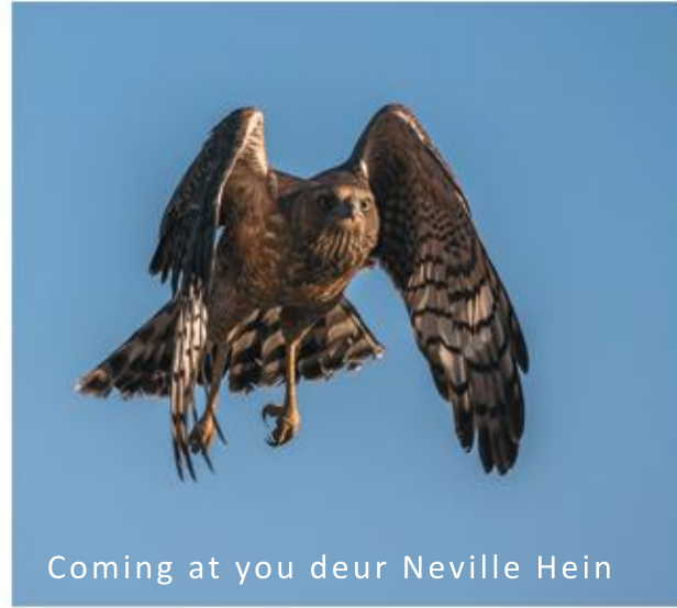
Coming at you deur Neville Hein