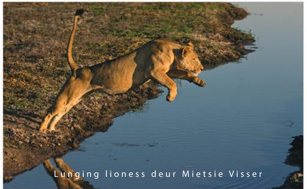
Lunging lioness deur Mietsie Visser