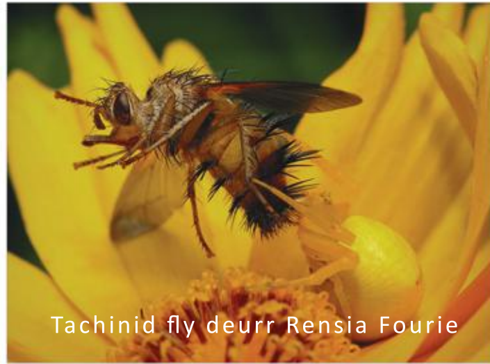
Tachinid fly deurr Rensia Fourie