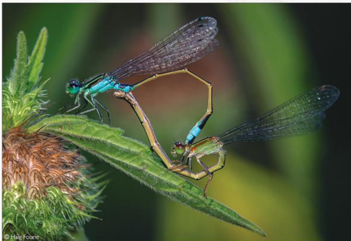
Mating of the damselflies. Parys, Free State, South Africa.

Baie gelukmet die uitsonderlike prestasie Haig Fourie.