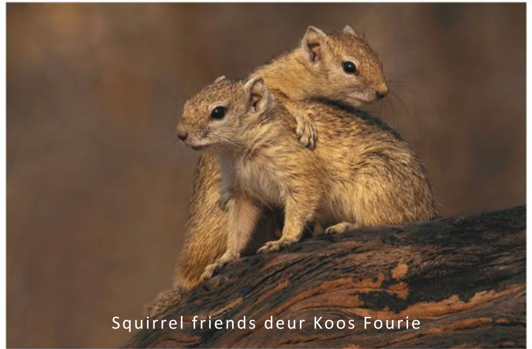
Squirrel friends deur Koos Fourie