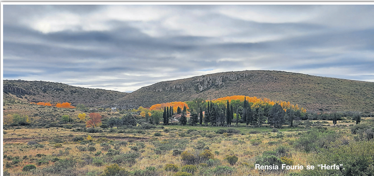
Rensia Fourie se "Herfs".