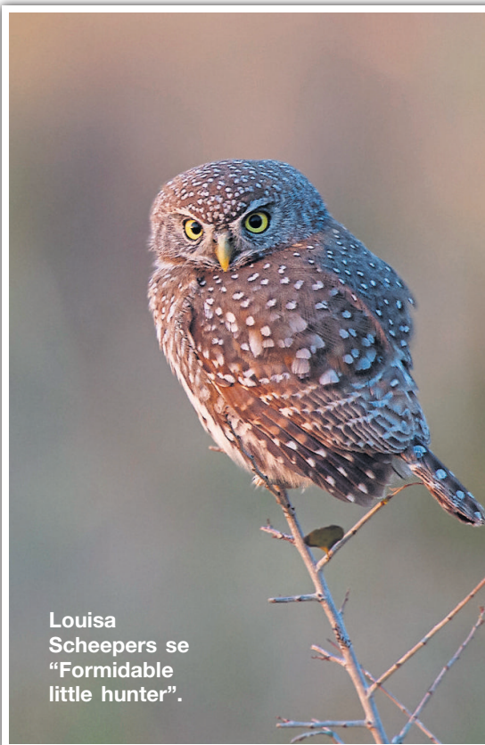
Louisa Scheepers se "Formidable little hunter".